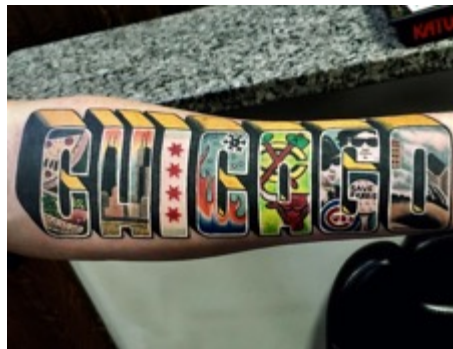
Locals proud enough to get tattoos of our murals (Seattle & Chicago.)